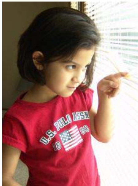
She'll thank you for your efforts!

Don't be afraid to seek child care services, especially during your startup phase. While one of your primary reasons for choosing to work from home is likely the ability to spend more time with your family, you won't be able to reach the comfort level that allows this without effort. Know that even if your children spend time with a sitter or another family member, you will eventually reach the point where you won't need this any more.