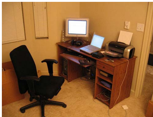
Carve your niche from the comfort of your own home

Of course, you can always carve a further niche into one of these ideas to make it your own.