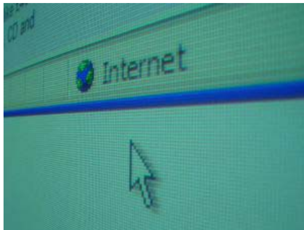
The Internet: Finding customers around the world

Is your niche starving for services? You can create a service-based online business using your skills, interests and hobbies. Because you don't have to create a product, service-based online businesses usually let you get started faster. Of course, you must be able to provide the services before you open your website for business.