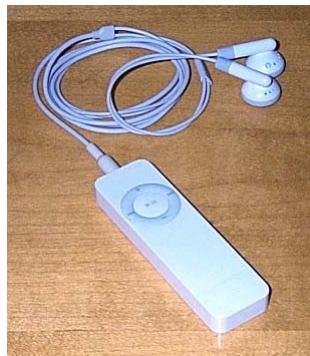
Tune in to tune out distractions

During your scheduled work time, you must develop the ability to concentrate on work. In a home office environment, there are endless distractions and disruptions that can seem all too tempting. Be careful, though: once you leave your office “just to wash the breakfast dishes,” you’re likely to find yourself still in the kitchen at lunch time, reorganizing the cabinets and wondering where the morning went.