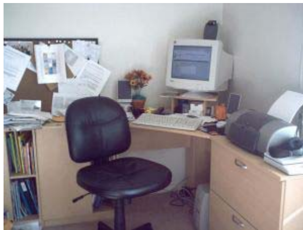
Learn to reach beyond your desk

You should plan to spend as much time marketing your business as you do in developing it. The best marketing plans are built around your efforts and networking, rather than the amount of money you spend on advertising. Most advertising programs that promise instant results for a fee are not worth the expense—only time and effort will build your Internet presence.